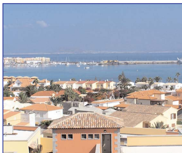
View towards Corralejo Harbour from the Clock Tower