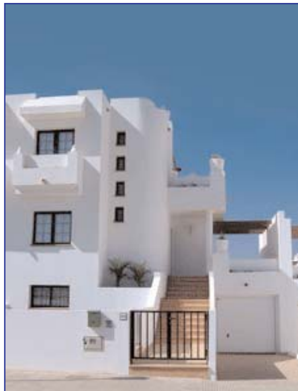
The Villa Royale

Situated near the centre of Corralejo on the Island of Fuerteventura, with only a short walk to either the new Baku water park or the beach, Villa Royale, on this new development, will suit those looking to holiday where a car is not required.